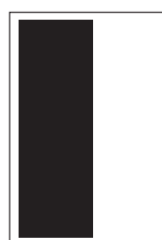
Half Page Vertical Advertisement 250mm x 88mm