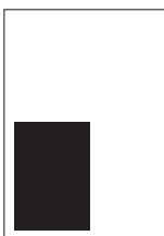
Quarter Page Vertical Bleed Advertisement 152mm x 112mm