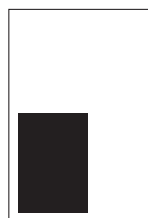
Quarter Page Vertical Advertisement 123mm x 88mm