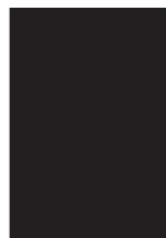
Full Page Inset Advertisement 261mm x 178mm