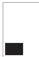
Eighth Page Horizontal Advertisement 60mm x 88mm