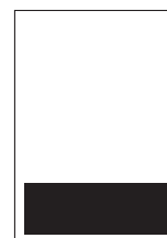
Quarter Page Horizontal Advertisement 60mm x 180mm