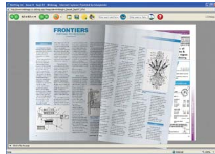
Knitting International is available in hard copy or e-magazine format.